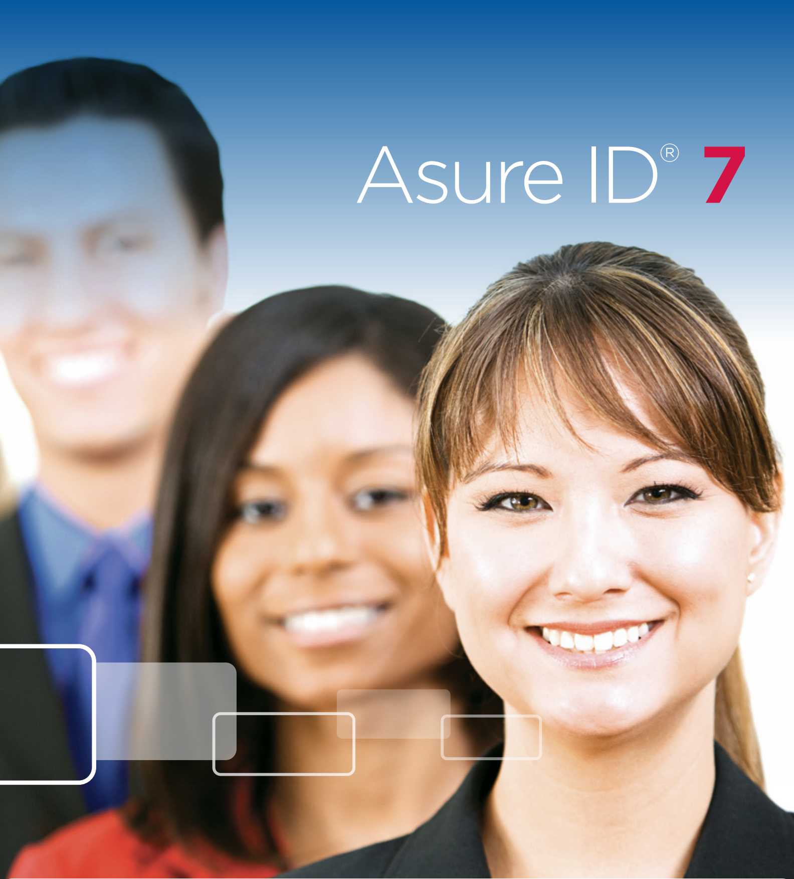
PHOTO ID CARD SOFTWARE