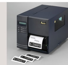
> Cutter mode