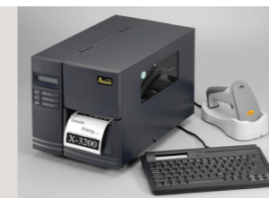
> X Series, Argokee & Scanner