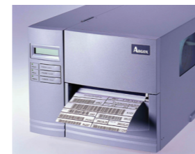
> G-series provides wide 6" printing

The G-6000 offers the industrial standard 6 inch width to give you high speed performance and greater extension of the printing area. Built-in LCD display, 1 MB flash memory, PS/2 interface for your PC keyboard provides the essential structure for Plug and Play stand-alone operation. Perfectly designed metal case resists rough treatment, heat, and dust, and ensures continuous quality operation, even in the most demanding environments. Superior historical control enhances high printing quality, and is perfect for printing of barcode and small alphanumeric. The G-6000 is simple to operate and it is easy for the user to perform adjustments and maintenance.