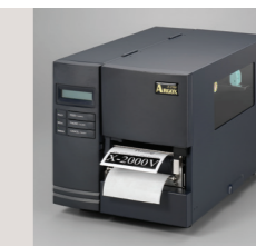
> Dispenser mode